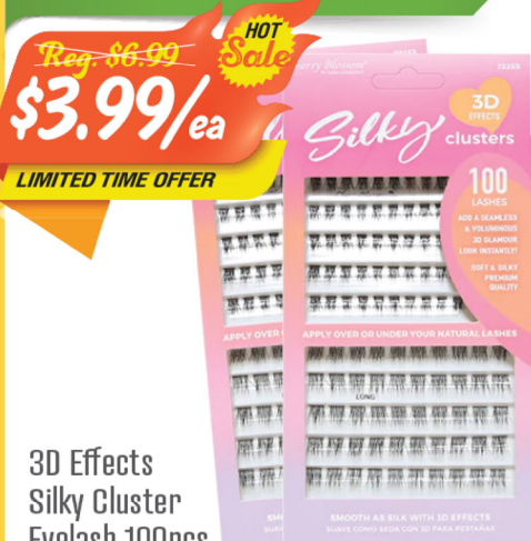
3D Effects Silky Cluster Eyelash 100pcs