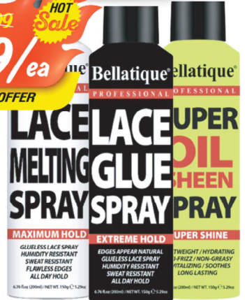
Lace Spray Melting/Glue/Oil Sheen 6oz

Reg. $5.99 HOT Sale $3.99/ea LIMITED TIME OFFER