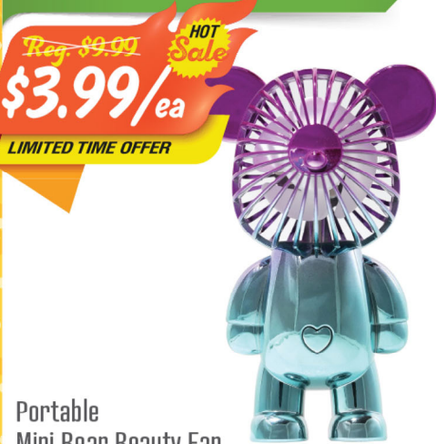
Portable Mini Bear Beauty Fan