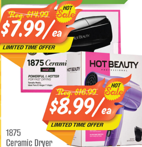
1875 Ceramic Dryer