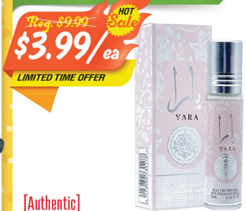
[Authentic] Oil Concentrated Perfume Roll-On 10ml