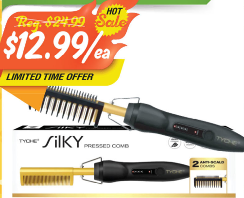
Silky Pressing Comb