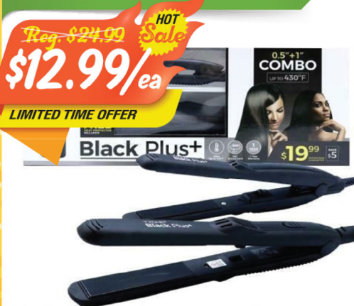
Black Plus+ Combo - Ceramic Flat Iron [Include Free Heat Protector Spray]