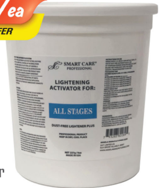
All Stages Bleach Powder 8oz

Reg. $7.99 HOT Sale $4.99/ea LIMITED TIME OFFER