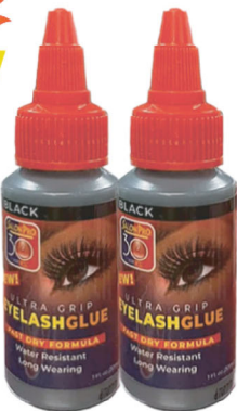
Ultra Grip Eyelash Glue Black 1 oz

Reg. $3.99 HOT Sale $1.99/ea LIMITED TIME OFFER