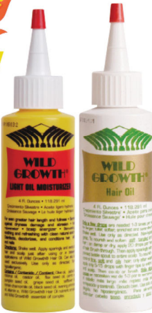
Light Oil Moisture/ Hair Oil 4oz

Reg. $9.99 HOT Sale $5.99/ea LIMITED TIME OFFER