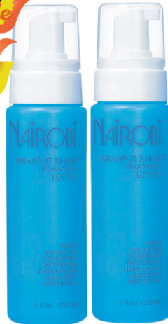
Foam Wrap Lotion 8oz

Reg. $12.99 HOT Sale $7.99/ea LIMITED TIME OFFER