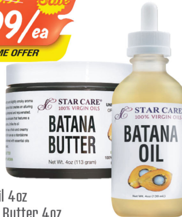
Batana Oil 4oz & Batana Butter 4oz

Reg. $9.99 HOT Sale $6.99/ea LIMITED TIME OFFER