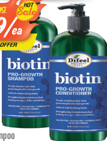
Biotin Shampoo & Conditioner 12oz

Reg. $6.99 HOT Sale $3.99/ea LIMITED TIME OFFER